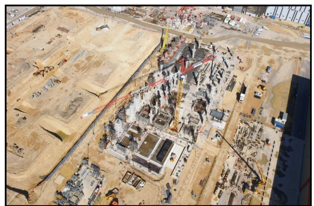
Cryoplant Building (July 2016/October 2016)