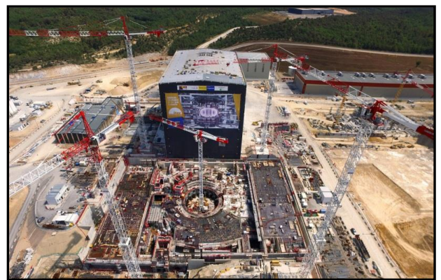
Tokamak Complex and Assembly Hall (April 2016/October 2016)