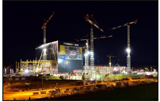
The ITER Assembly Hall (December 2015/November 2016)