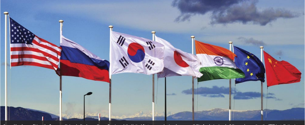
Seven Members – China, the European Union, India, Japan, Korea, Russia and the United States – are sharing the responsibility for designing, building and operating the ITER installation in southern France. First Plasma is planned for December 2025.

"I do believe that the development of fusion for the future world energy supply is not negotiable. If we want to quit our dependence on burning fossil fuels, which leads to ever-rising CO2 emissions, we have to deliver fusion energy to the grid as soon as we can. Fusion's energetic potential is unparalleled. It is within our grasp to change the energy future of generations to come."