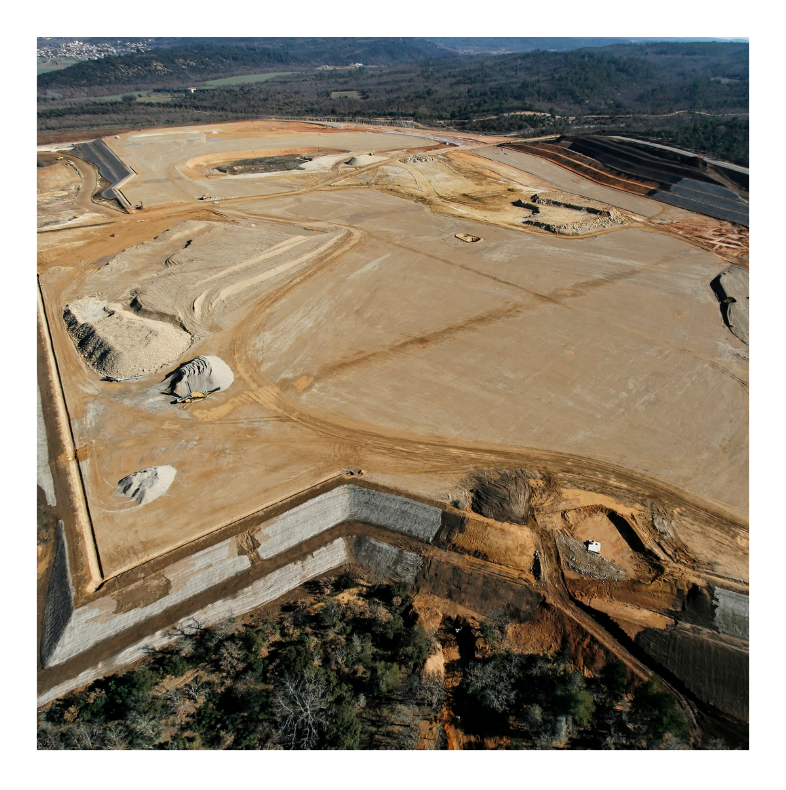
ITER Organization Financial Statements 2008