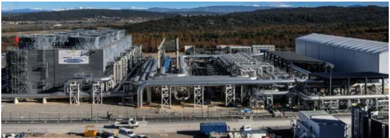
Secondary Cooling Water area / Heat-Rejecting System