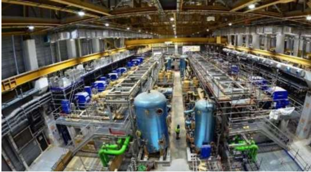
Cryoplant area / Warm Compressor Station